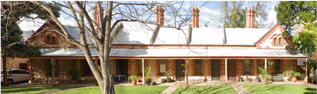
Lady Ayers Homes, 51 – 60 Kingston Terrace