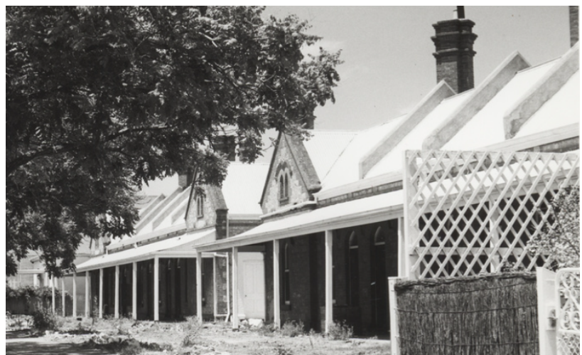
December 1971